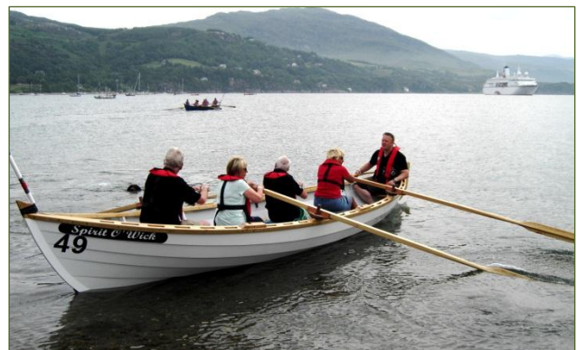
Loch Broom, Ullapool

WCRC volunteers successfully built its first skiff "Spirit O' Wick" and have participated in a range of community events, gala's and competitions. WCRC continue to increase its membership and have almost completed their second skiff. "WCRC aim to act as a catalyst to spread the sport of coastal rowing to other harbours across northern Scotland with a vision to see a fleet of skiffs providing sport and entertainment for local communities eager to maintain and strengthen their maritime heritage. The building of the skiffs has attracted a wide range of volunteers of all ages and brought together folk who would never have met ordinarily. Similarly, rowing the skiffs has generated interest from all ages and abilities – it is an ideal way of becoming and keeping fit and friendships are being formed across the whole community."