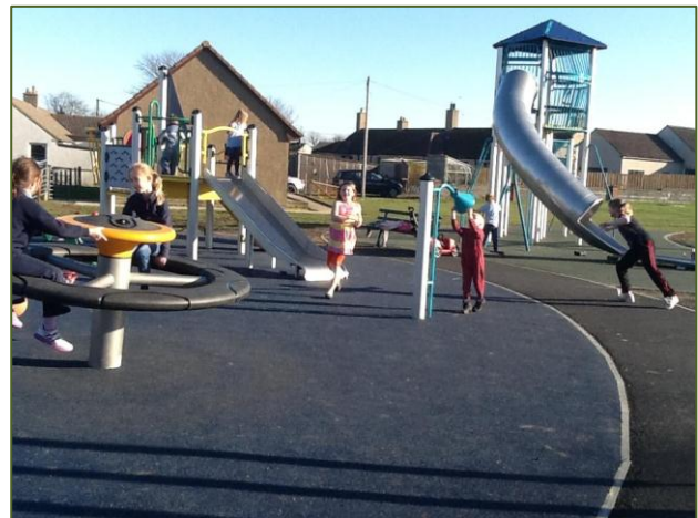
Watten Play Park

The play park was completed in January 2014 and the new play area has provided the village of Watten with better recreational facilities for children and families, increasing the attractiveness of the area as a place to live work and invest in. “The play area is improving the lives of the local community and is promoting healthy living. It is bringing people together and has made our small local community stronger for the future. It has also been attracting families out to visit our village benefitting all services in our community.”