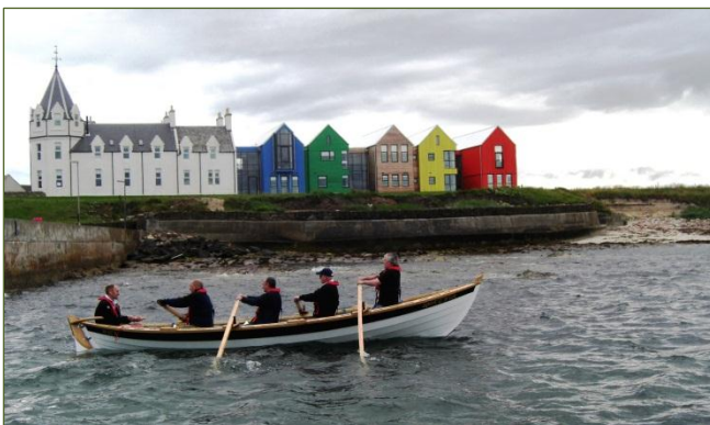
John O'Groats Harbour Day

WCRC sought funding assistance towards the club's start-up costs and for the construction of three Skiff rowing boats to enable the club to organise rowing tuition and races for teams. The Skiffs comprise a plywood kit that is built into a 22 ft long boat taking around 1200 hrs of voluntary labour.