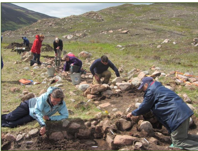
Volunteers excavating at the longhouse site

Timespan sought funding assistance towards a community excavation project to unearth information about a traumatic period in the community's history. The Translocation Excavation was a community-led excavation of a longhouse at Caen in the Strath of Kildonan and was part of a programme of events marking the Bicentenary of the Kildonan Clearances 1813-2013.