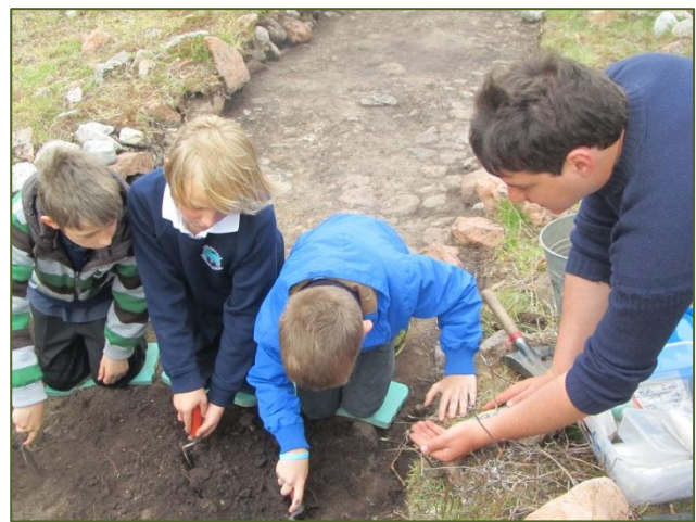
School children visiting the excavation site

The excavation programme also included a wide variety of community activities including research field trips, training and workshops as well as an events programme with local schools. A significant number of artefacts were discovered through the community excavation, many of which were broken in unusual ways suggesting that the tenants of the longhouse had left in a hurry. “This was a memorable event – as much for its novelty as for its potential to unearth history and the local community were positively engaged with developments at every stage of the project”.