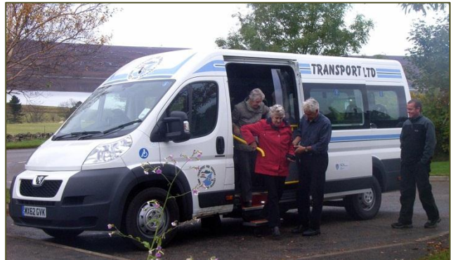
Transport for Tongue New Minibus

This project has significantly improved the local transport infrastructure of this rural community by providing community transport to link the three villages of the parish of Tongue to each other and to the nearest town, rail link and city. T4T are now well established and continue to develop its transport infrastructure services for its community. “This project has enabled us to improve people’s access to local amenities, health and other public services as well as promoting social inclusion.”