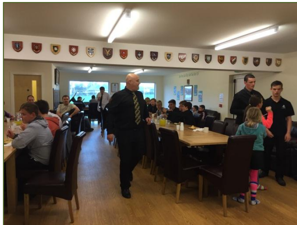
Caithness Rugby Football Club Sports Pavilion

CRFC had for many years identified the need for replacement facilities. The club undertook a substantial programme of fundraising events and sought funding assistance towards building a new four changing room rugby pavilion with associated facilities to replace its old pre-fabricated hut.